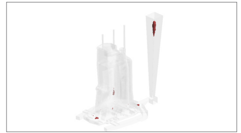
Visualization in Click2Cast of shrinkage porosity in the exhaust housing part.

With the enhanced casting process in place, Woodland/Alloy Casting is continuing to see the benefits of both cost and time savings due to the simulation capabilities that are offered in Click2Cast. Woodland/Alloy Casting has employed Click2Cast on a number of casting projects since first discovering the software last year and is continuing to explore all the features, settings and tools that the software provides.