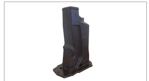
Final casted exhaust housing part.